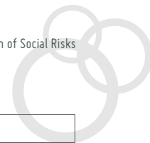
Table 1 Operationalisation of the selected social risks